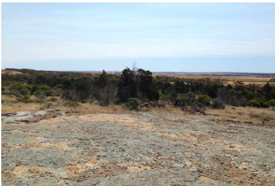
Plate 10-1 View from Waddikee Rocks

The Warramboos cemetery (Plate 10-2) is located east of Warramboos, off Kimba Road and approximately 200 m west of the proposed mining lease boundary. No other cemeteries are located within 5 km of the proposed mining lease boundary, with the nearest alternative cemeteries located at Kyancutta, Lock, Wudinna and Darke Peak.