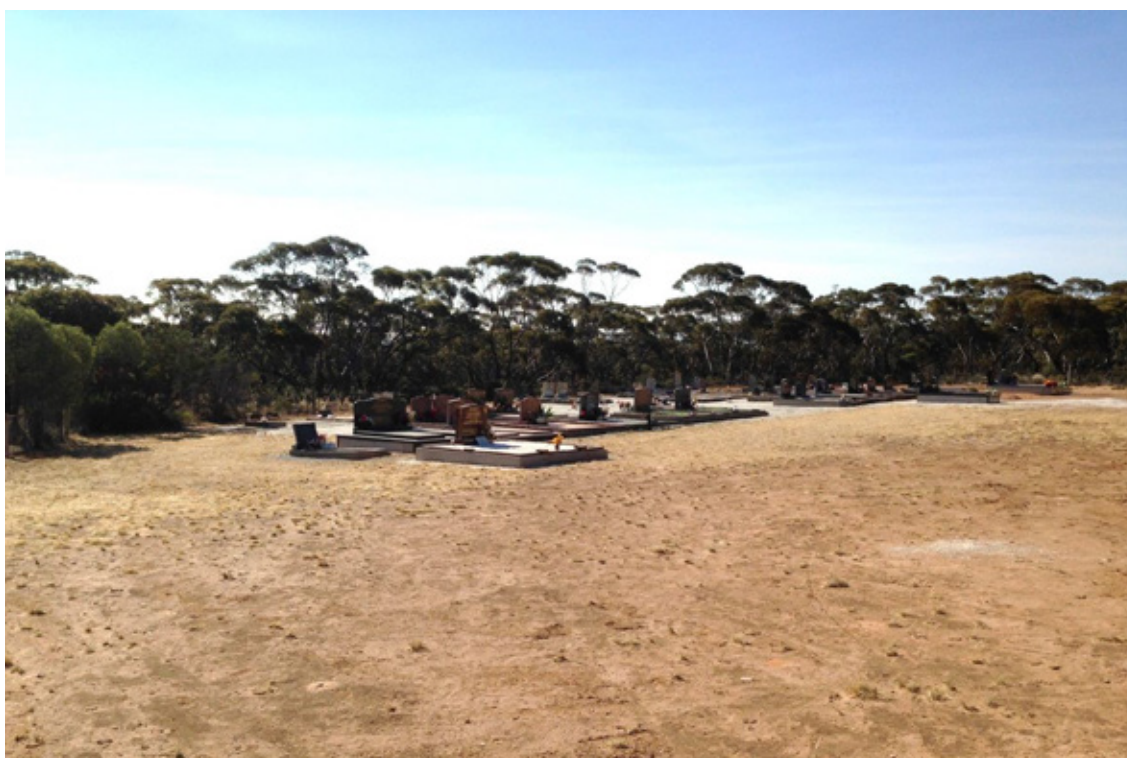
Plate 10-2 Warramboos Cemetery

The Warramboos cemetery (Plate 10-2) is located east of Warramboos, off Kimba Road and approximately 200 m west of the proposed mining lease boundary. No other cemeteries are located within 5 km of the proposed mining lease boundary, with the nearest alternative cemeteries located at Kyancutta, Lock, Wudinna and Darke Peak.